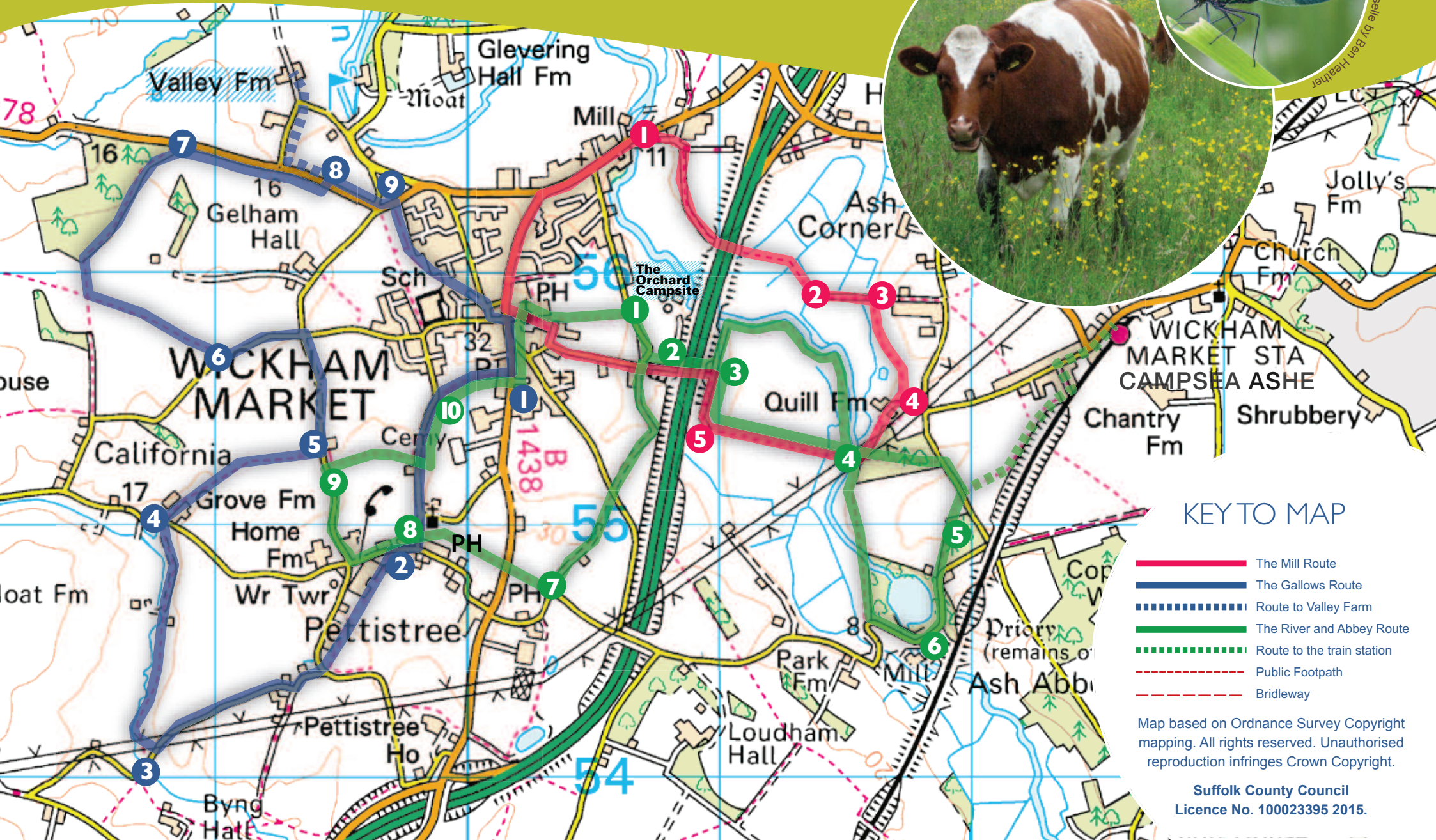
Blue Barbed Demoiselle by Ben Heather

Three circular walks around Wickham Market