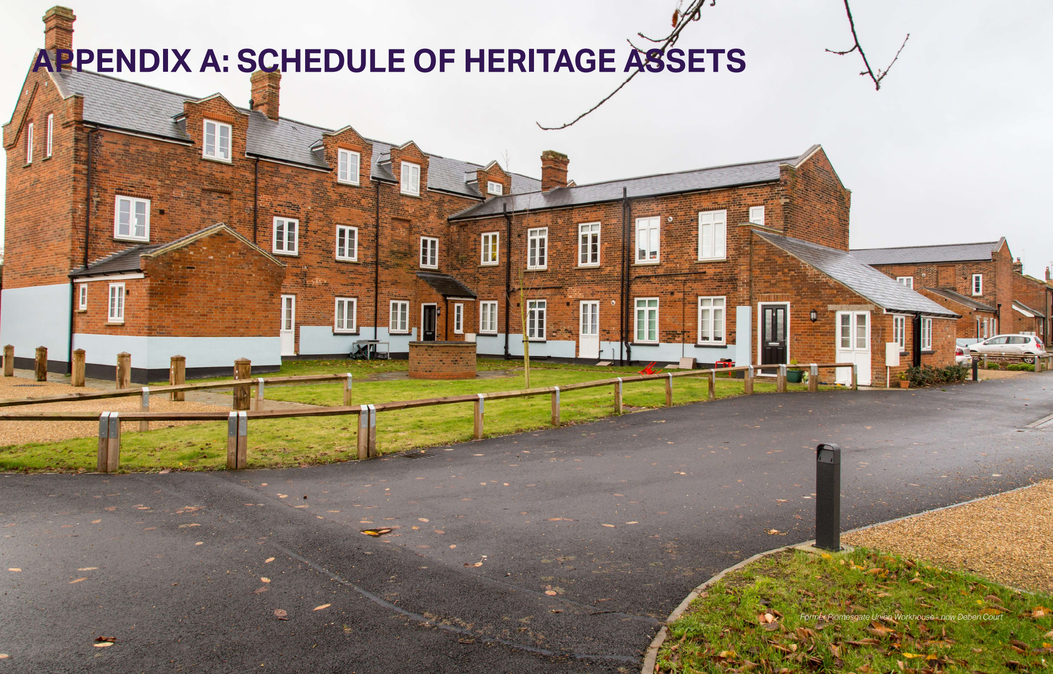
Former Plomesgate Union Workhouse - now Deben Court